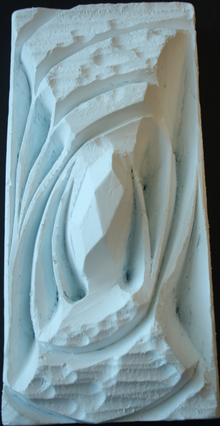
reconstructed CNC model