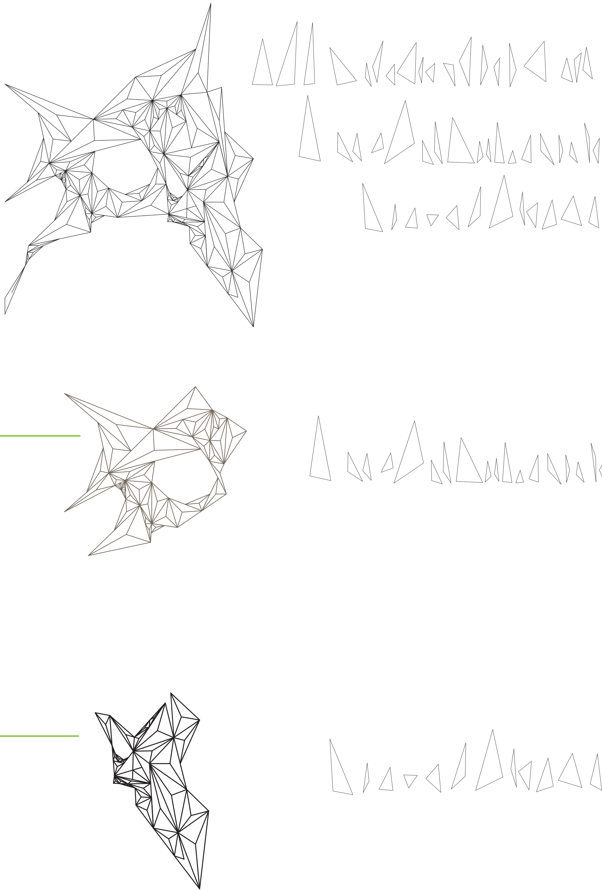
h. phylogram and assembly logic