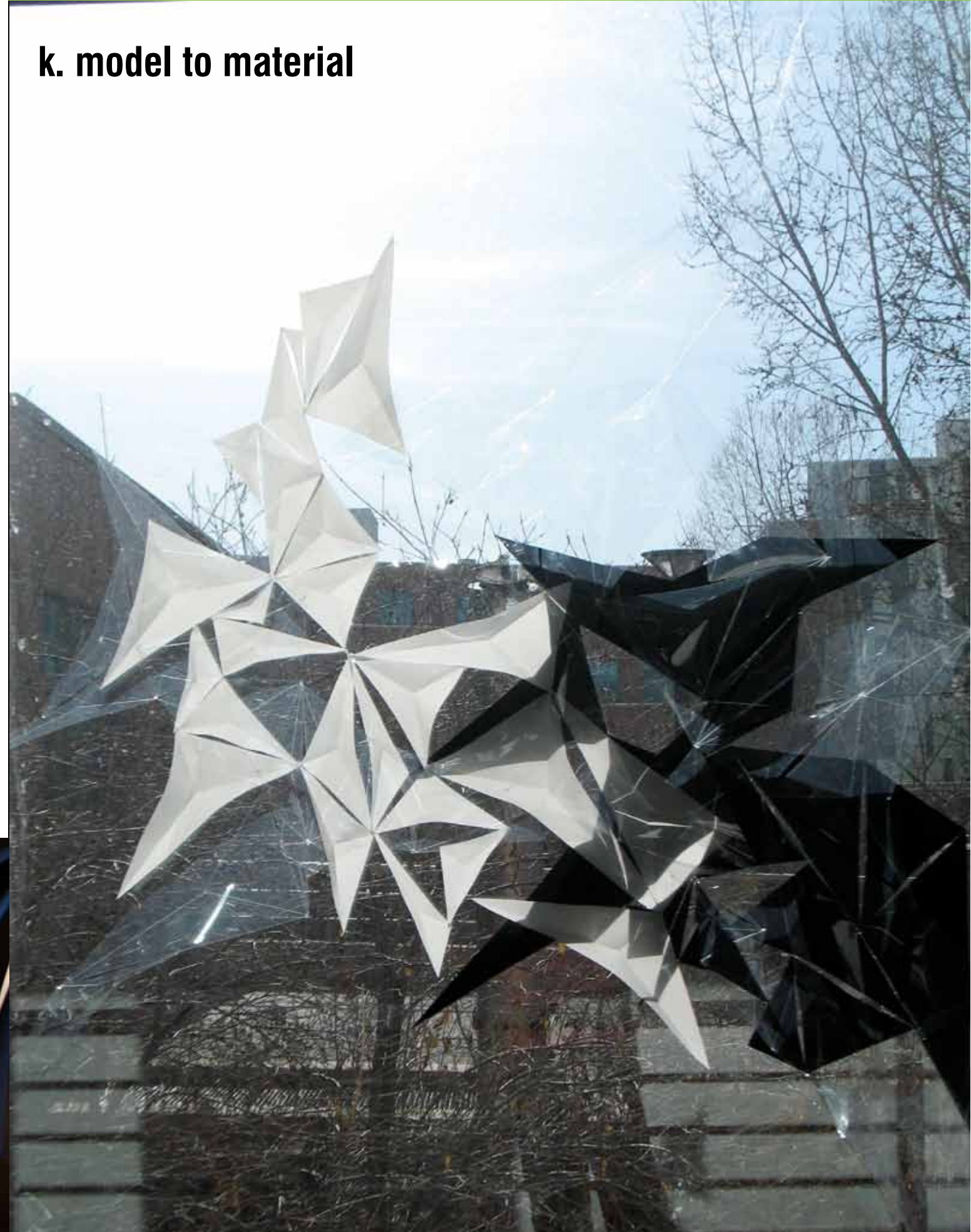
k. model to material